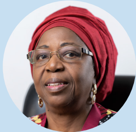
Professor Awa Marie Coll Seck Former Minister of Health & Social Action of Senegal and President of Galien Forum

A global leader in public health and infectious diseases, helping us think bigger about health systems and innovation.